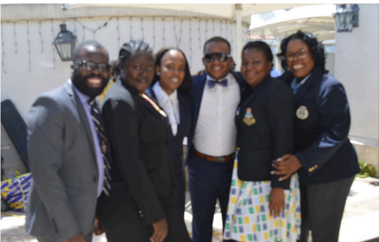
Rep. from SVG, Grenada, BVI, Guyana and Turks and Caicos