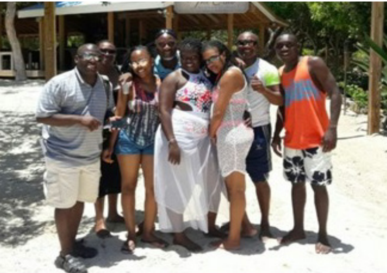
Members Made A Visit To Norman Island After The 2017 AGM Came To An End.