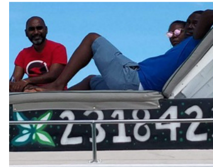
Mr President and friends aboard our Catamaran cruise to Little Water Cay.