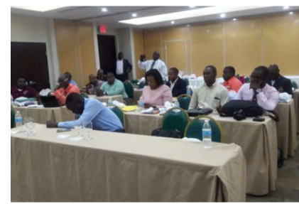
Members asking questions throughout a presentation at the General meeting in the British Virgins 2017 Islands.