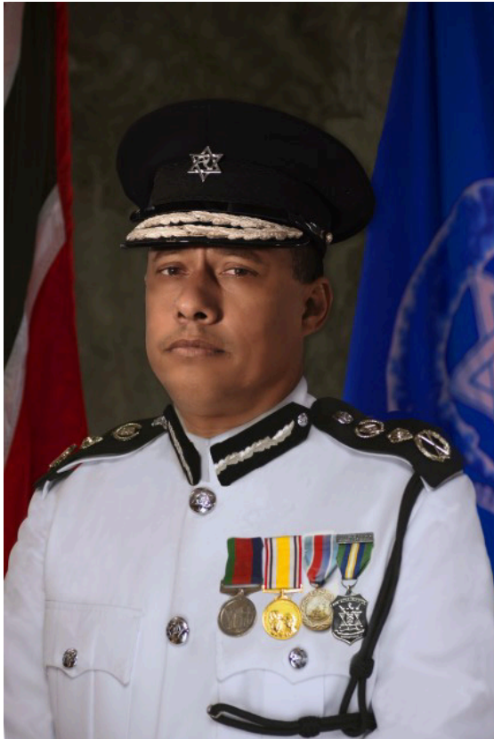
Mr. Gary Griffith Commissioner Of Police Trinidad And Tobago

When I assumed the helm of the Trinidad and Tobago Police Service, I knew the task would be multi-dimensional requiring a number of different levels of strategic input in order to obtain the results and to bolster the direction of intelligence led policing.