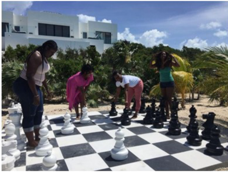
After a day filled with learning its only fair we have a game or two.