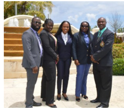
Vincentians attending the 2018 General Meeting in Turks and Caicos.