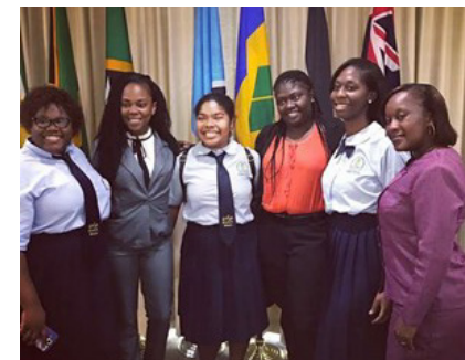
Students from the Phenix Soutt High School Band along with members of CFPWA 2018 AGM BVI.